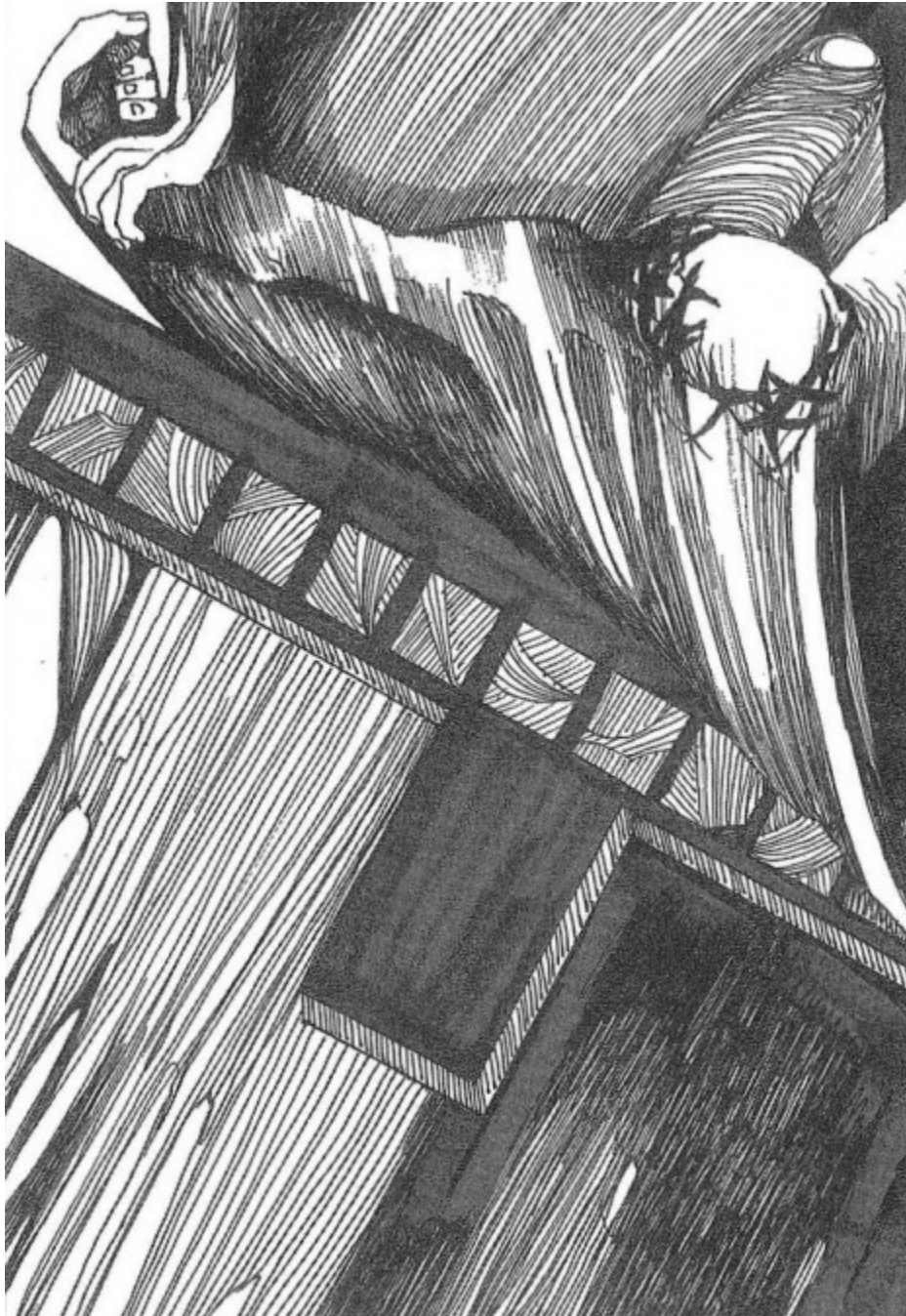
Pinned Fast to His Kingship

. . . and the hammer fell . . . and fastened Jesus to the cross — the symbol of His Kingship. To His friends the terrible irony of the cross was a symbol of despair —until the resurrection when it would be seen as the symbol of all hope.