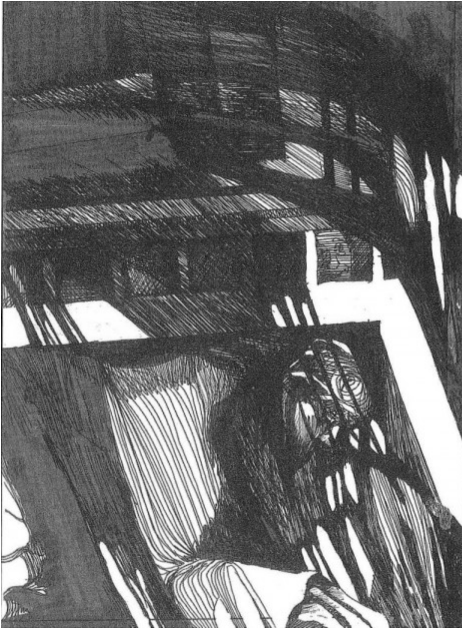
Stainless Steel Throne

If Christ was crucified today it probably would not be on rough-hewn wood but on inhuman hard-edged stainless steel.