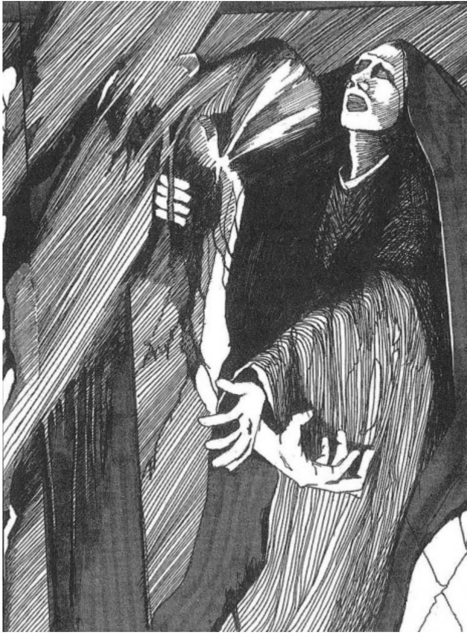
The Wounded Healer

"And yet ours were the sufferings he bore, ours the sorrows he carried. But we, we thought of him as someone punished, Struck by God, and brought low. Yet he was pierced through for our faults, crushed for our sins. On him lies a punishment that brings us peace, and through his wounds we are healed." (Isaiah 55:4-5)