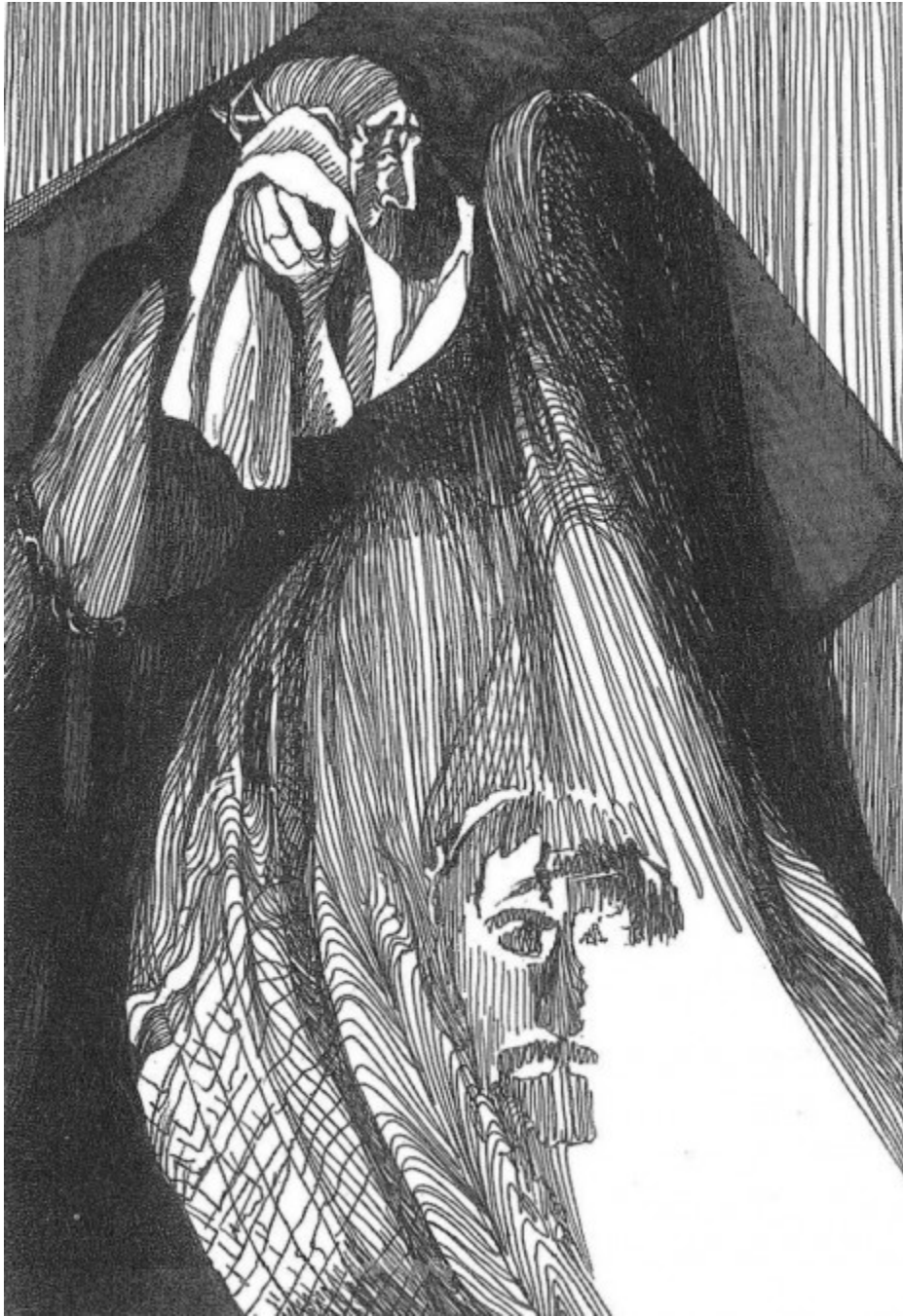
Vera Icon (True Image)

A hand of compassion reaches out and wipes the tears and blood revealing Christ's face.