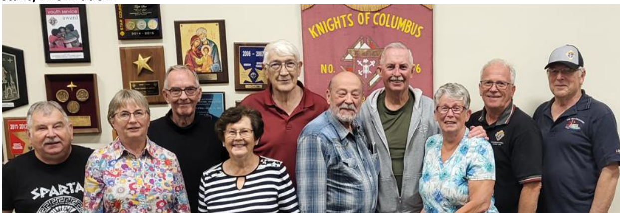
Grey Cup football pool envelope stuffers on Sep 30