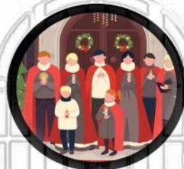
Chorale Notre-Dame- de-L'Assomption