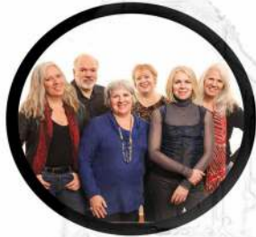
La famille Campagne

Tickets/billets: adult $50 adulte student $25 élève 12 & under free/ 12 ans et moins gratuit