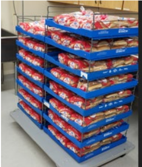
Here’s what 100 dz buns looks like

Thank you to all the volunteers who ‘pitched-in’ over the two days. In addition to Council members & spouses (couldn’t do it without them) we had six members of the Parish join us at various times during the day. Thank you very much! Smiling faces, positive remarks from the teams.....it was a great day!