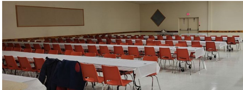
Looks quiet, right?