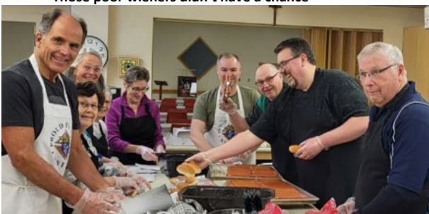
Hot dog assembly line – a well-oiled machine