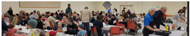
half the hall during one of the sessions