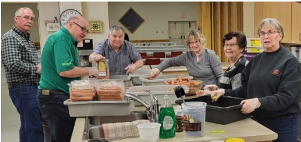
Those poor wieners didn’t have a chance